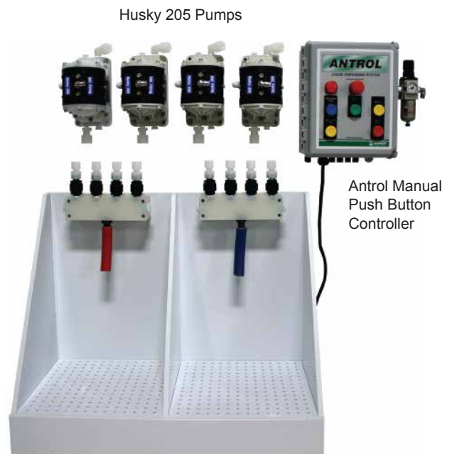
Husky 205 Pumps ACDS-8-2 Dual Dispensing Stand