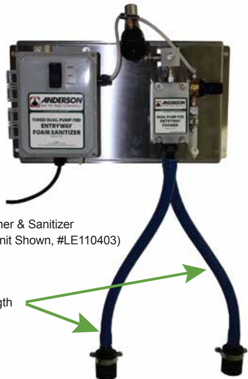
EntryWay Foamer & Sanitizer (Double Door Unit Shown, #LE110403)