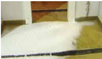
Double Doorway Foam Nozzle Placement