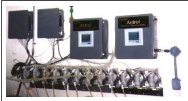
PLC Control, LCD Interface, Double-Stroke Air Pumps

Each Dispensing System Is Individually Designed