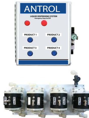
Husky 205 Pumps