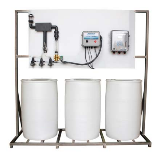
Shown with optional stand